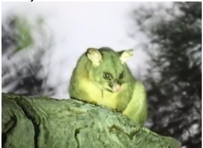
Brush-tailed Possum at Hannah Watts Park

Possum Walk at Hannah Watts Park January 2024 ? Details TBA